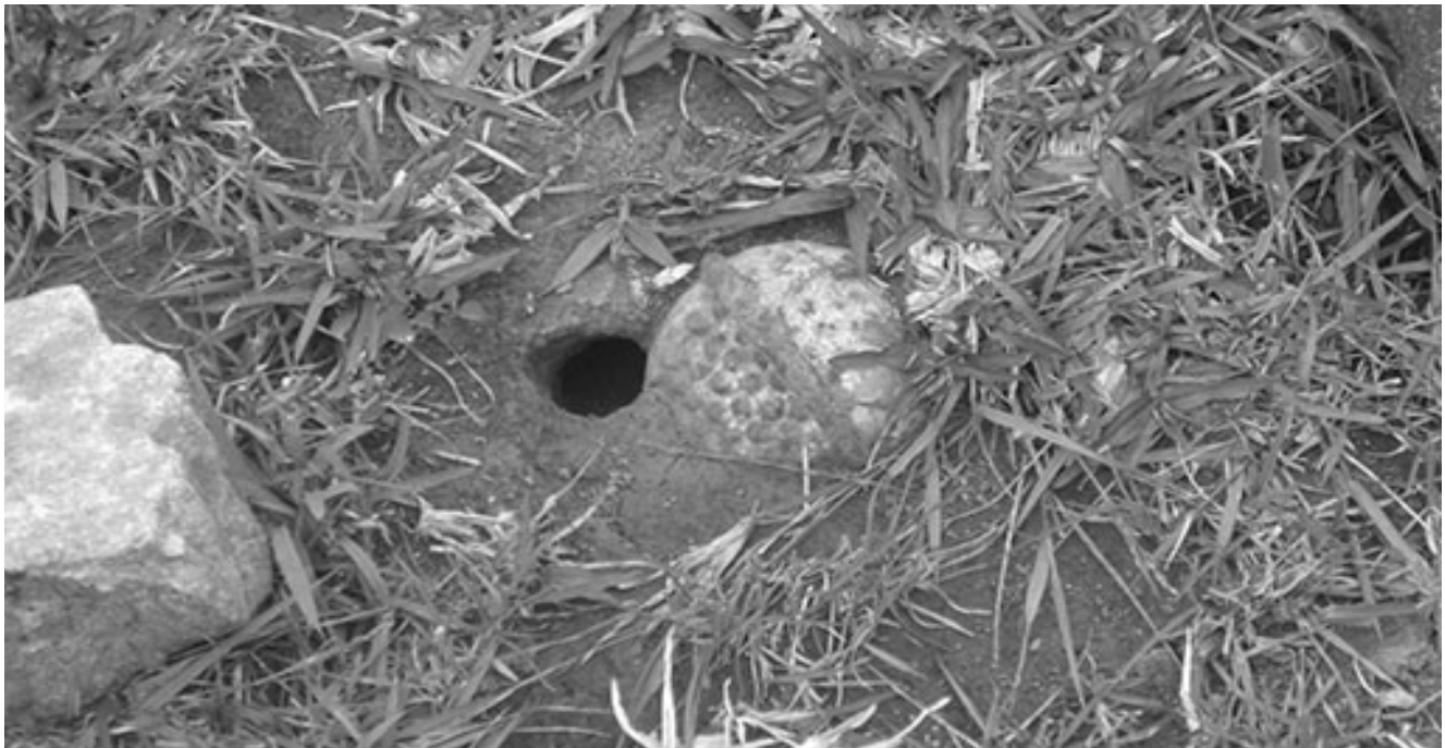
Unexploded cluster sub-munition found at Plain of Jars, Laos. Original color photo converted to black and white.