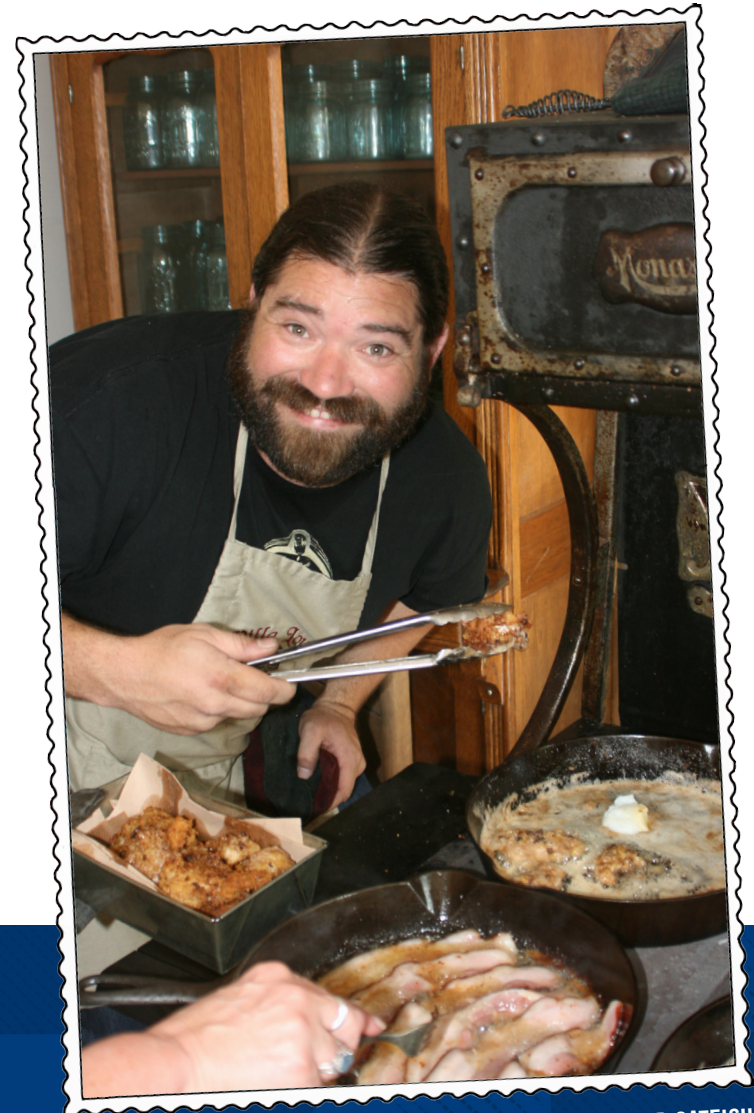
MAN COOKING FRESH FRIED CATFISH

* Historic recipes often lack what we would consider today as key pieces of information. We recommend modern substitutions for any missing details.