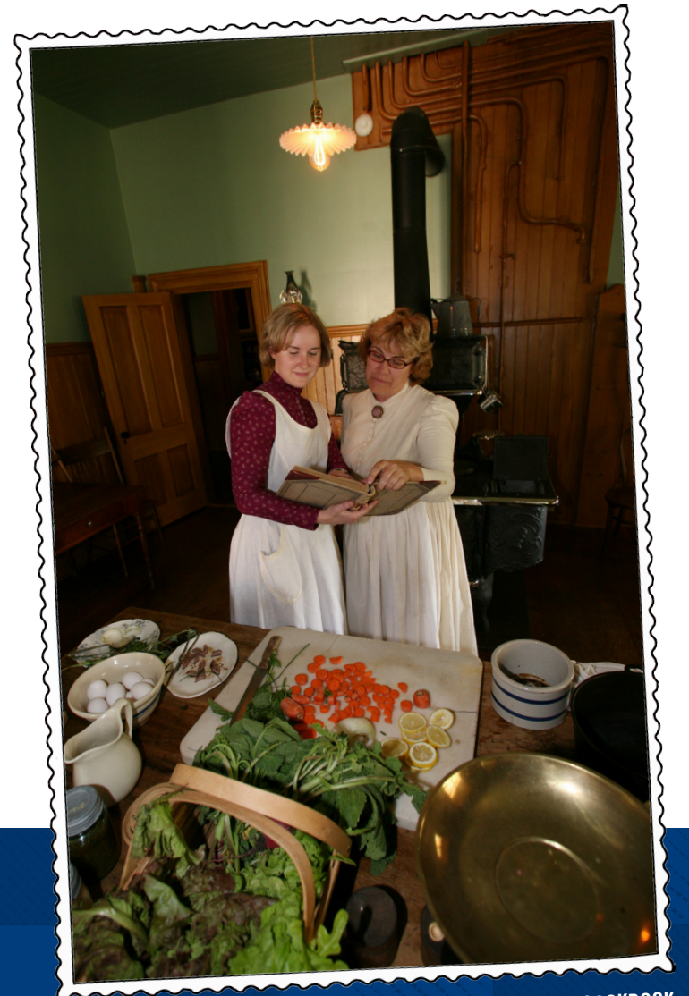
VILLA LOUIS INTERPRETERS READING A COOKBOOK

* Historic recipes often lack what we would consider today as key pieces of information. We recommend modern substitutions for any missing details.