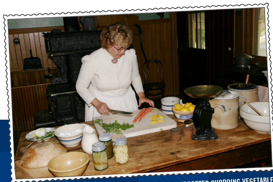
VILLA LOUIS INTERPRETER CHOPPING VEGETABLES

* Historic recipes often lack what we would consider today as key pieces of information. We recommend modern substitutions for any missing details.