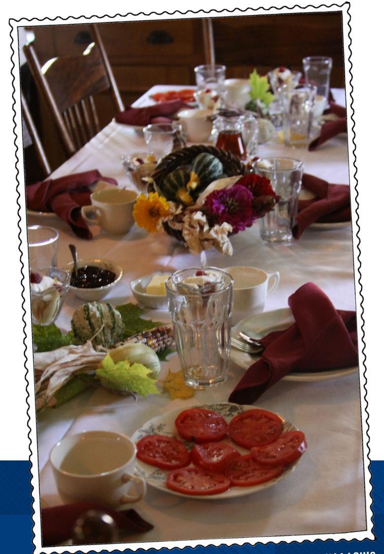
BREAKFAST TABLE AT VILLA LOUIS

* Historic recipes often lack what we would consider today as key pieces of information. We recommend modern substitutions for any missing details.