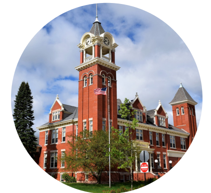
Marshfield City Hall rehabilitated through the Society's State Historic Preservation office.