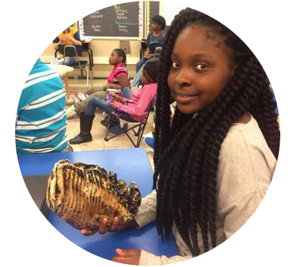
K12 student handles mastodon tooth through the Hands-On History program.