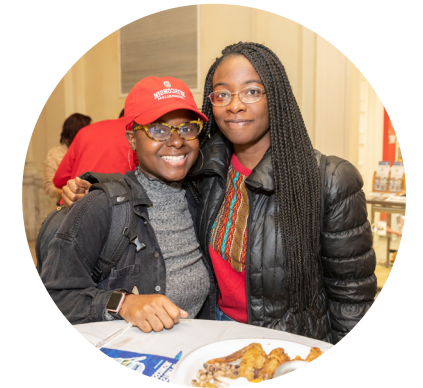
"Share your Voice" session in Madison, Wisconsin.